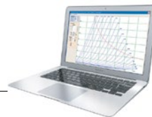
PC or PLC interface